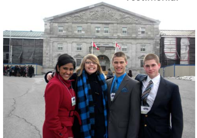
Forum participants in front of Rideau Hall March 25 to April 1st, 2011 Session

This Spring, while the country was buzzing with an election, over 200 students were in Ottawa, creating a fever of their own. A few blocks from Parliament Hill, high school students came together to participate in Forum. They had the opportunity to walk in the shoes of today's leaders, simulating Cabinet Meetings, a First Ministers Conference, role playing holding a mock election and debating the issues of the day. Their experience was brought to life exploring Parliament Hill, attending Question Period, sharing a breakfast with Senators and finally having dinner with MPs.